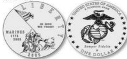
2005 Marine Corps 230th Anniversary Silver Dollar

These coins will go on sale July 20, 2005.