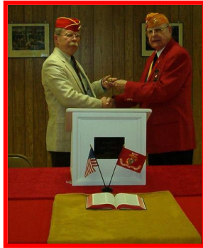
Commandant receives Charter