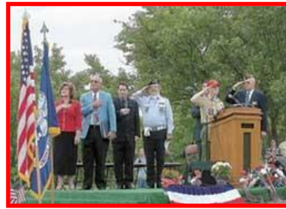
Sr. Vice Commandant delivers welcome remarks at Memorial Day