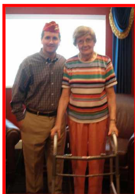
Marine Corps League purchases walker for Eunice